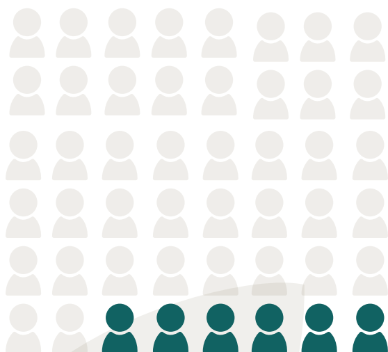
2020 – 6 members

This year witnessed a gratifying expansion in network members, growing from 6 founding members at the end of 2020 to a diverse group of 37 entrepreneurial women and men from all over the country