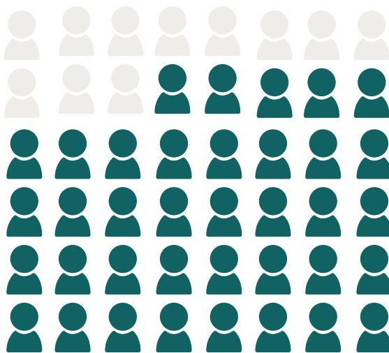
2023 – 37 members